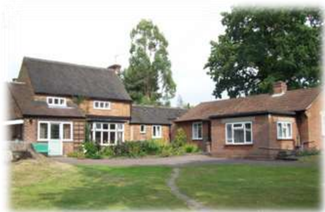
The guest cottage

Hospitality is a vital part of our lives as a way of sharing with others the prayerful atmosphere of our houses. We maintain at the Convent in Derby a Guest Cottage available for individuals seeking to spend a few days with God in a quiet, peaceful place. This space is also an ideal place for small groups (e.g. cell groups, ministry teams etc) to spend some time together.